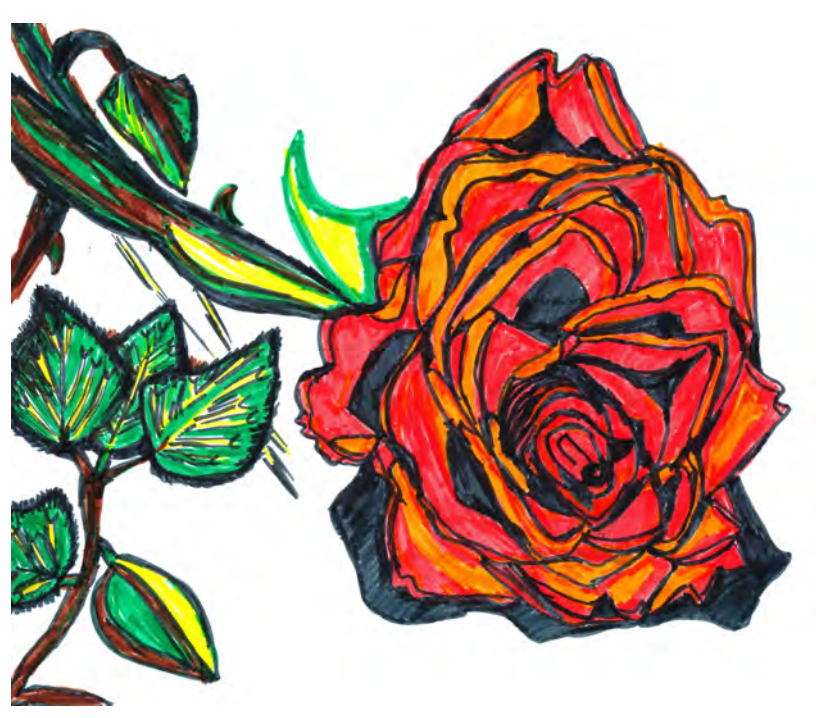
drawing by: Rachel\ MacDowell