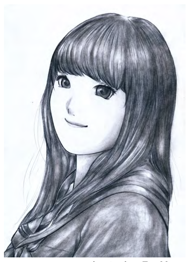
drawing by: Tao\ Ma