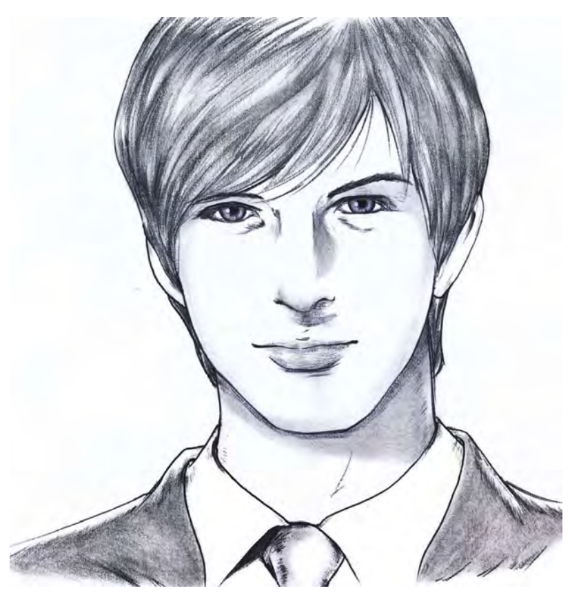
drawing by: Tao Ma