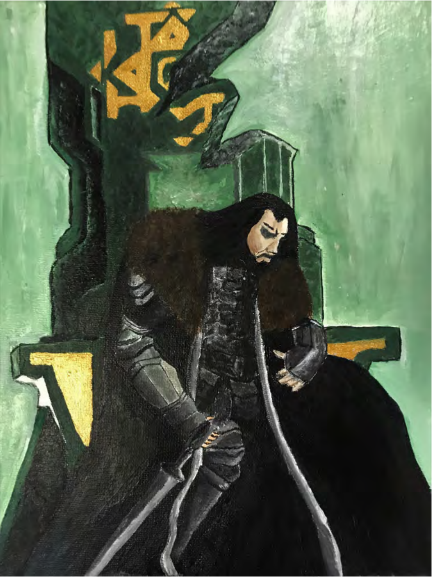
painting by: Ariel LaPlante